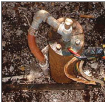
FIGURE 5 Well with sanitary seal type cap

Turn off power to the pump. Mix the volume of bleach needed with at least 45 litres (10 gallons) of water. Remove the well cap 1 and lift the wires out and pull to one side. Clean the cap to remove debris, dirt and oil and place in a clean container. Pour or siphon the chlorine solution into the well between the drop pipes (pipes that carry water from a pump in a well to the surface) or pour the solution directly into the well. Some wells have a sanitary seal (see Figure 5) with either an air vent or plug that can be removed to add the chlorine mixture – contact a registered well driller or well pump installer for assistance, if required.