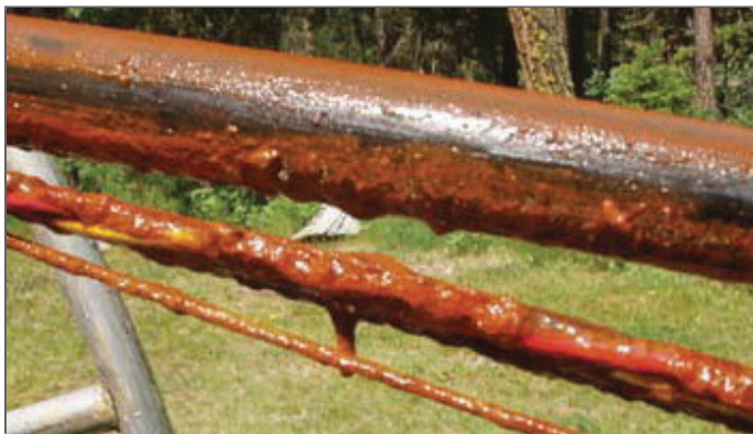
FIGURE 3 Biofilm on well wiring

Nuisance bacteria such as iron-related or sulphate-reducing bacteria are often found in groundwater and water wells. If uncontrolled, these bacteria can colonize the intake area of a well. The colonies form a sticky, slimy substance called biofilm (see Figure 3 below), which can reduce well production and degrade water quality. Also, minerals in groundwater can settle out and accumulate on well screens over time. The simple chlorination method is not effective in penetrating or removing biofilm and mineral build-up. To prevent the accumulation of biofilm and minerals regular disinfection of the well is recommended in cases where bacteria have been detected.