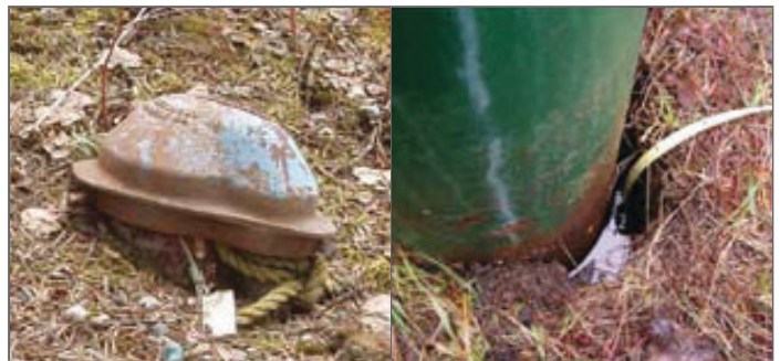
FIGURE 1 Well casing stickup less than 30 cm (1ft) from the ground surface

If you answered “YES” to any of the above questions, fix the problem before proceeding with disinfection. Otherwise the well will continue to be vulnerable to contamination.