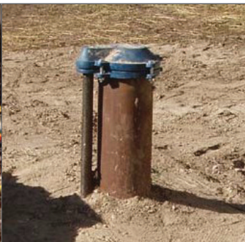
FIGURE 6 Well fitted with pitless adapter, cap has space for wiring

If possible, mix the water in the well by attaching a clean hose to a nearby water tap or hydrant, place the hose into the top of the well casing, and run the water from the hose, which is sourced from the well, back into the well.